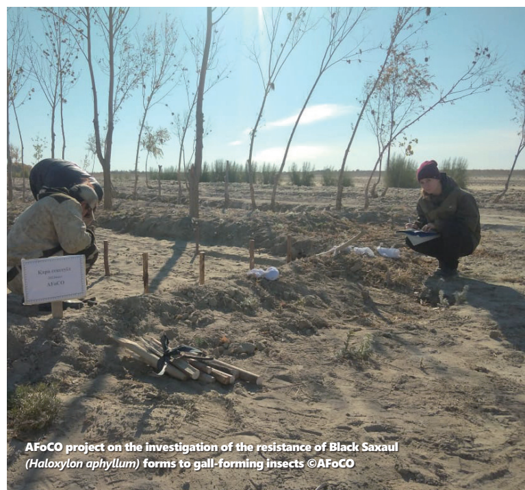
AFoCO project on the investigation of the resistance of Black Saxaul ( Haloxylon aphyllum ) forms to gall-forming insects

The workshop facilitated the identification of needs and specific topics for capacity building at the country and regional levels for Central Asia's forest and forestry sector. Situational analyses on capacity-building and potential training topics for the Central Asian region were conducted, and a pool of resource persons and facilities were identified for the development of a collective action plan for capacity-building in the Central Asian region.