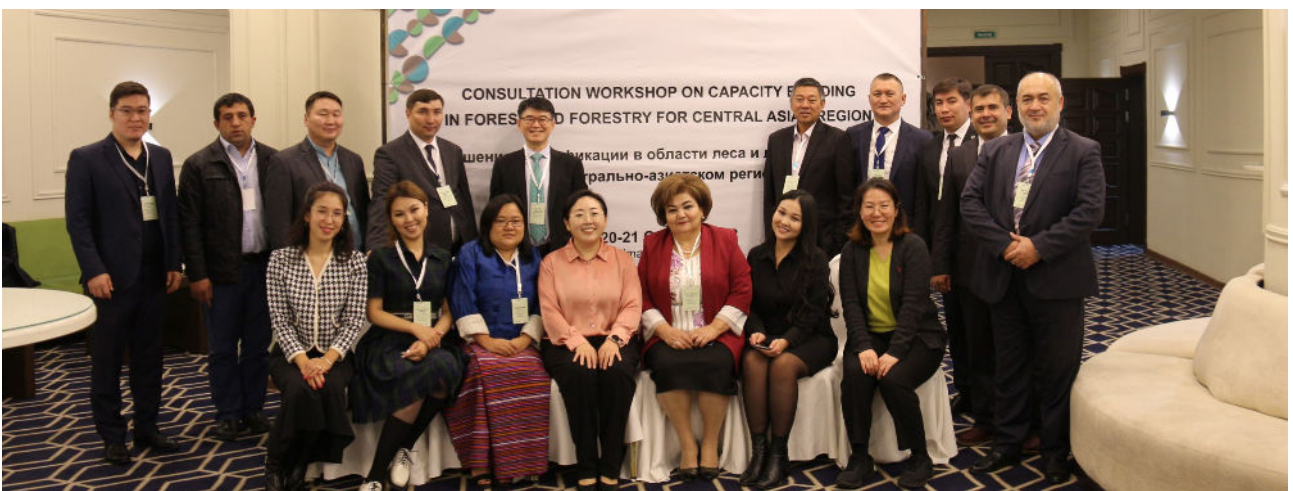
Group photo with the workshop participants