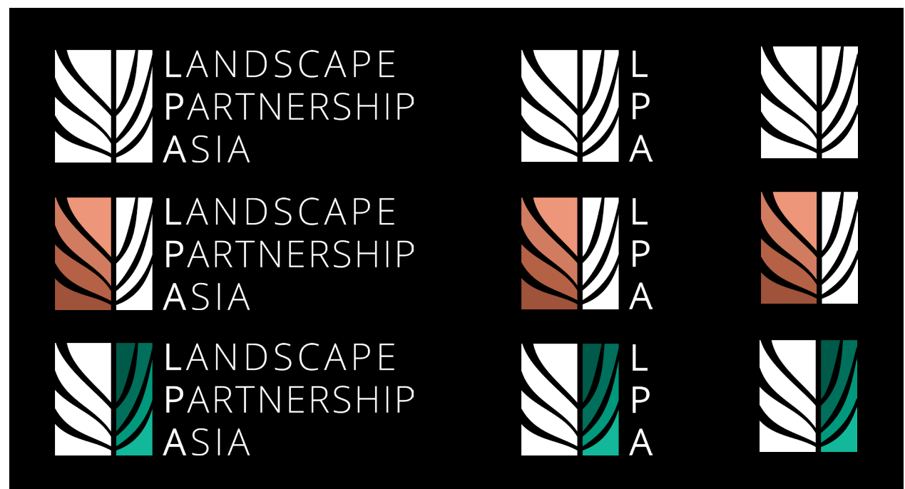
Logos for use on black and/or dark backgrounds